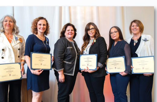
▶ CPUP Nursing Clinical Excellence Winners